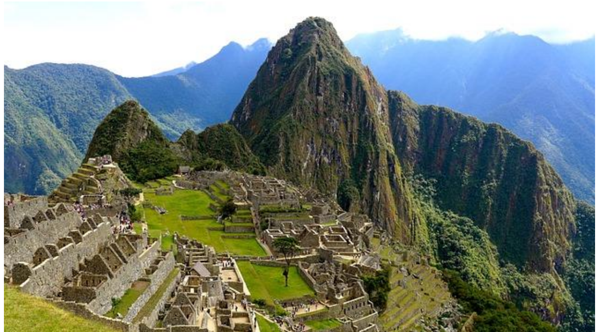
Machu Picchu was built as an estate for the Inca emperor Pachacuti.