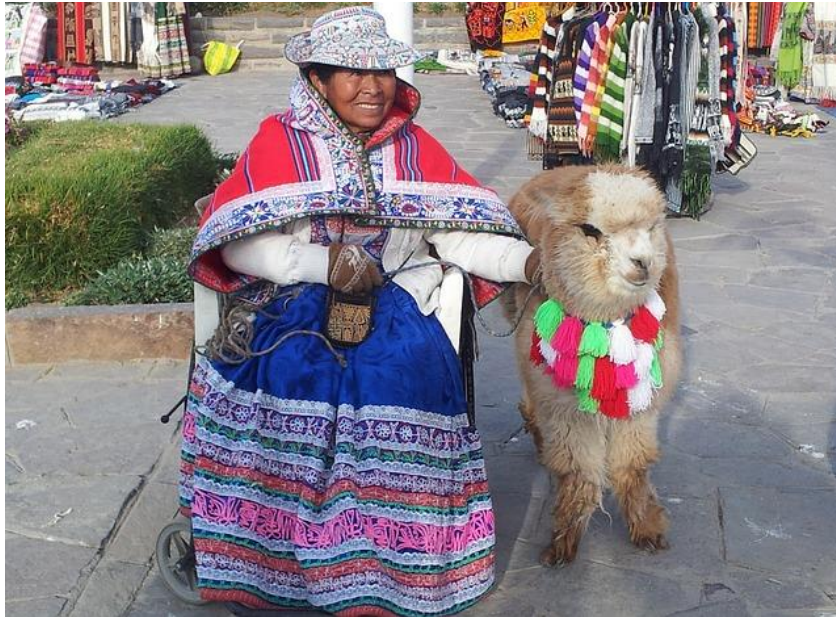
Pollera (full skirt) and Manta (wrap around the shoulders)