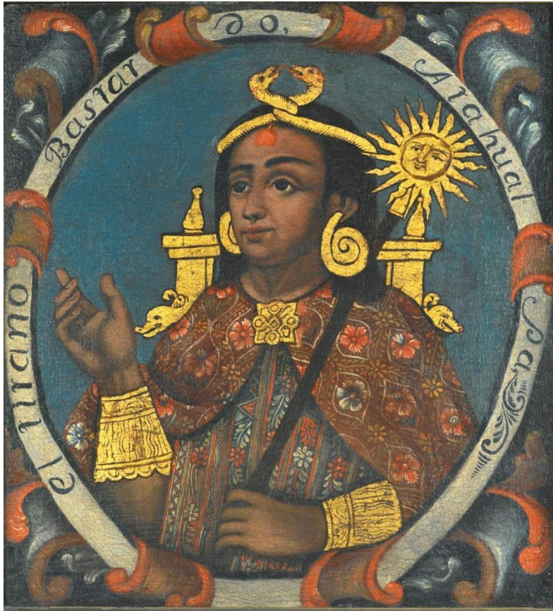
Atahualpa, Fourteenth Inca, painted between 1750-1800

Native people called the Incas ruled Peru from 1300- 1535. They built roads and cities like Cuzco. Spain conquered the Incas and made them their slaves. By the late 1700s, the people of Peru fought back against the Spanish and in 1821, Peru became free from Spain.