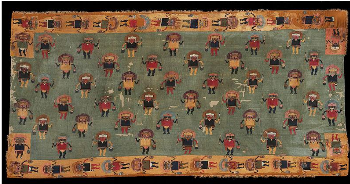
Ceremonial Mantle, 100 BC-100 AD

Hundreds of years ago the Inca wove images of animals and gods into their cloth. Today some Peruvians still weave. They use wool from llamas and alpacas.