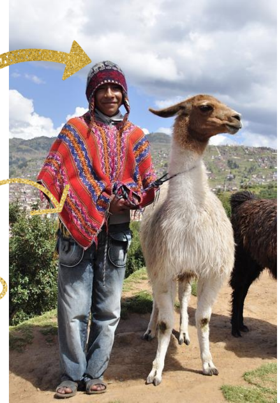
Poncho (blanket with a hole cut out to fit over the head)